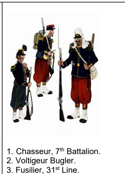
1. Chasseur, 7 th Battalion. 2. Voltigeur Bugler. 3. Fusilier, 31 st Line.