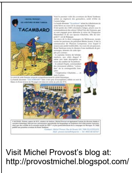
Visit Michel Provost's blog at: http://provostmichel.blogspot.com/