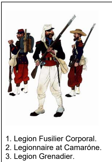
1. Legion Fusilier Corporal. 2. Legionnaire at Camarone. 3. Legion Grenadier.